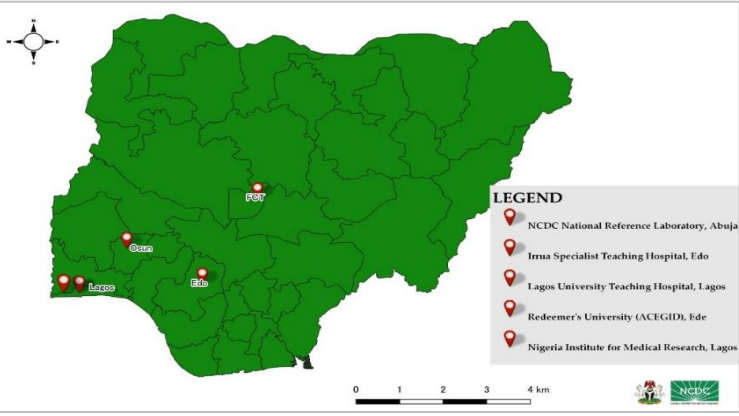
Figure 1: Map of Nigeria showing COVID-19 affected State